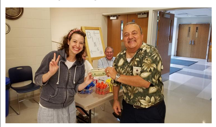
First two-time winner