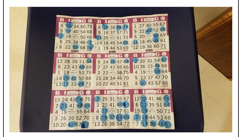
First winning sheet