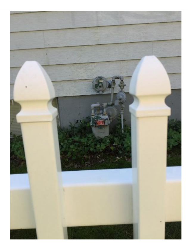
However, it all cleaned up very well!