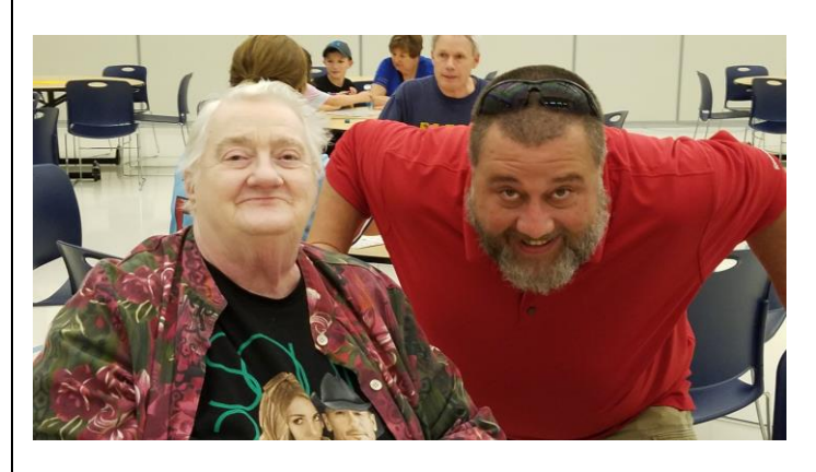
First two to Bingo on one game

First Bingo event on May 27<sup>th</sup>, 2017